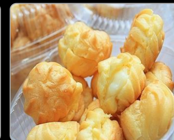
CREAM PUFFS Filled French pastry ball with a sweet filling of custard and cream