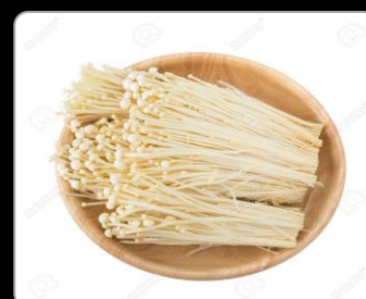
ENOKI MUSHROOM Mild, delicate flavor that is complimented by a slight crunch