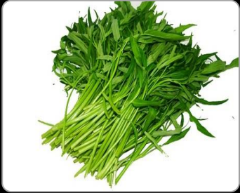
WATER SPINACH Used extensively in tropical regions of Southeast Asia