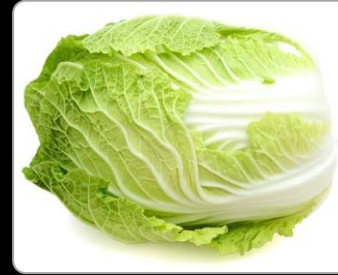
NAPA CABBAGE Mild and slightly sweet taste, less pungent compared to other cabbages