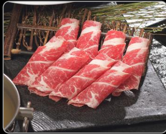
ANGUS BEEF Less fatty and tougher than the fatty beef