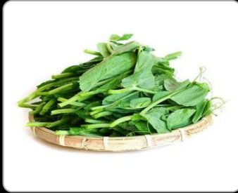
SNOW PEA TIPS Incredibly rich-flavored due to the thick layer of fat