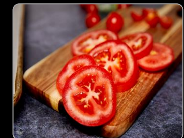
TOMATO Nutrient-dense superfood used with all kinds of hot pot soup