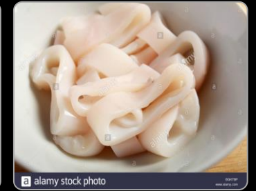
SQUID Smooth and firm, though not crunchy. Better not overcooked