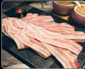
PORK BELLY Incredibly rich-flavored due to the thick layer of fat