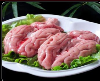
PIG BRAIN According to old tradition, you become smarter after eating pig brain