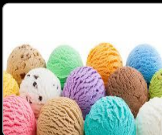
ICE CREAM Strawberry, Chocolate, Green tea, Vanilla flavor