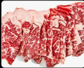
FATTY LAMB Compared to beef, lamb is firm with a tender texture