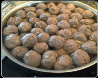
BEEF TENDON BALL Must-try with the traditional "pho" soup