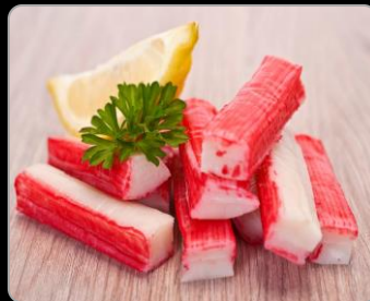
CRAB STICK Made of starch and finely pulverized white fish