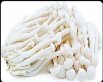
SEAFOOD MUSHROOM Its texture makes it a great compliment to soup