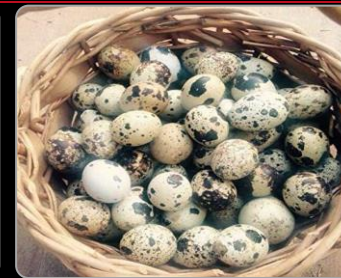
QUAIL EGG Similar to chicken egg but with an extra-rich, creamy yolk