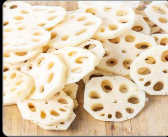
LOTUS ROOT Crunchy texture but become softer when cooked in soup