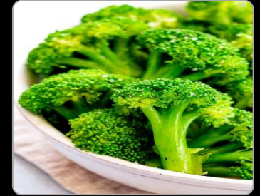
BROCCOLI Most popular cabbage plant with good source of fiber and protein