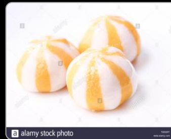
CHEESE FISH BALL Fish ball with added cheese in the filling