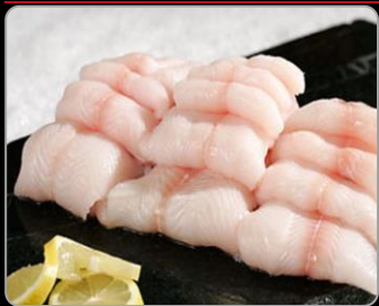
RED SNAPPER FILLET Delicious, lean fish that delivers high protein kick and lower fat