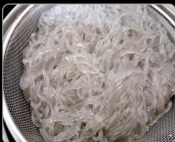
CCLEAR VERMICELLI NOODLE Chewy and transparent noodle made from starch and water