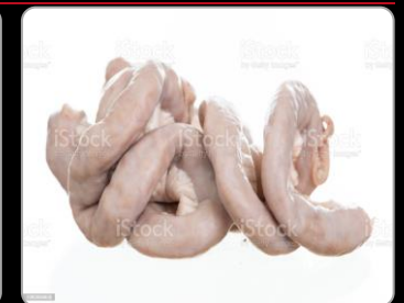
PORK INTESTINE Tough and firm and must be cooked thoroughly