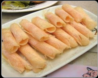
CHICKEN Traditional thin-sliced chicken breast or thigh