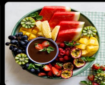
FRUIT Orange, Watermelon, Melon, Grapes