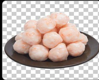
SHRIMP PASTE BALL Made from finely crushed shrimp or krill mixed with salt