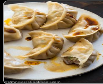
PORK/CHICKEN DUMPLINGS A dough wrapped around a filling, chicken or pork flavor