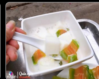
COCONUT JELLY TAPIOCA Tapioca balls served in deliciously sweet coconut juice