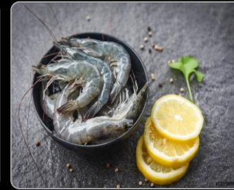
SHRIMP The most popular seafood used in any good hot pot feast