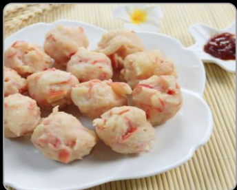
IMITATION LOBSTER BALL Combination of lobster meat and imitated Alaska pollock