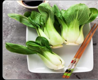
BOK CHOY Mild, cabbage-like flavor, crunchy but juicy texture