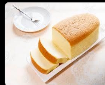
CUSTARD CHEESE CAKE elit.