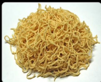
JAPANESE EGG NOODLE Soft and slightly savory from the addition of eggs to the dough