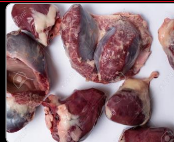
CHICKEN GIBLETS The neck, gizzard, heart and liver of a chicken