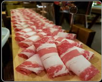
FATTY BEEF Rolled, thin-sliced fatty beef. Must-have for a hot pot feast