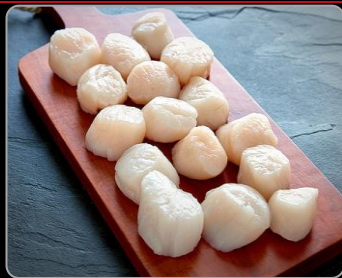
SCALLOP Sweet, buttery, and a great source of protein and antioxidants