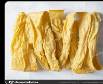
DRIED BEAN CURD Crunchy tofu skin formed on the surface of boiled soy milk