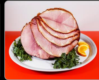
HAM Does it need any explanations?