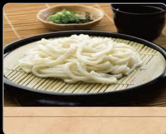
UDON NOODLE Thick and chewy Japanese noodles made from wheat flour