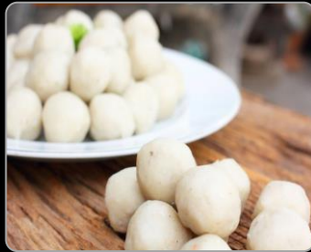
FISH BALL Round in shape and most often made from cuttlefish or pollock