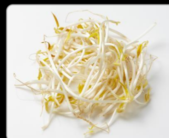
BEAN SPROUT Young, sprouted mung bean packed with nutrients