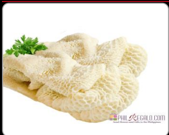
BEEF TRIPLE Beef stomach, an excellent source of vitamin B12 and zinc