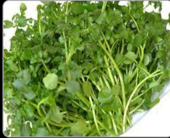
WATERCRESS Packed with vitamin K and antioxidants