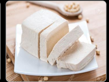
JAPANESE TOFU Fresh tofu used for vegetarian or any kind of soup