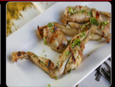
FROG LEGS Mild flavor with a texture most similar to chicken wing