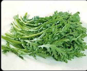
EDIBLE CHRYSANTHEMUM Flavored, watery and used to cool body heat