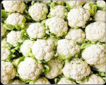
CAULIFLOWER Great source of fiber and antioxidants