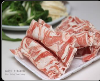
PORK LOIN Mild-flavored but very juicy and tender when cooked