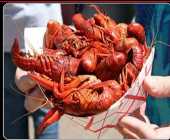
CRAWFISH Does not need any descriptions. Must-try with soup