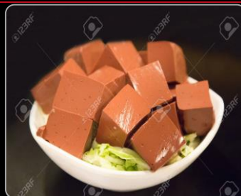
COOKED PIG BLOOD A lot safer and yummier to eat than it sounds