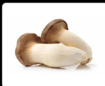
KING OYSTER MUSHROOM The largest oyster mushroom with meaty texture