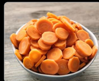
CARROT Crunchy, tasty, and highly nutritious