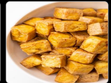
FRIED TOFU Great plant-based source of protein