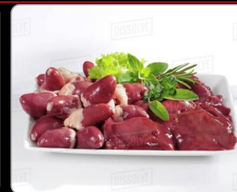
CHICKEN LIVER/HEART Loaded with iron and vitamin B12