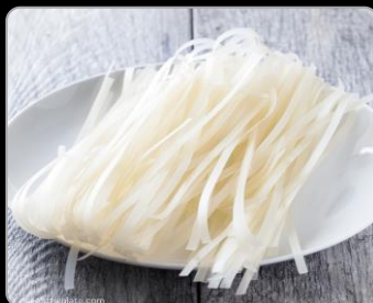
VIETNAMESE "PHO" NOODLE Narrow rice noodle used for traditional "pho" broth