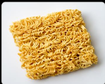
RAMEN INSTANT NOODLE Traditional instant noodle cooked in hot broth