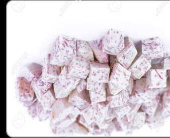
FRIED TARO Creamy flavor and used to enhance soup flavor