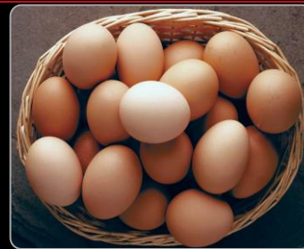
CHICKEN EGG Chicken egg and noodle soup is a perfect combination