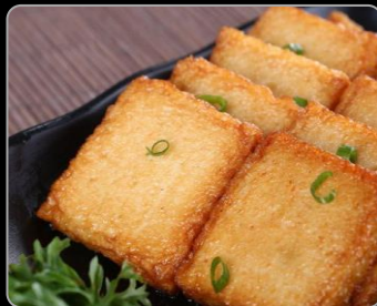
FRIED FISH TOFU Starchy fish cube that has a tofu-like texture