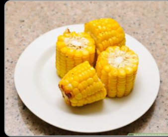
BABY CORN Used to sweeten and enhance soup flavor