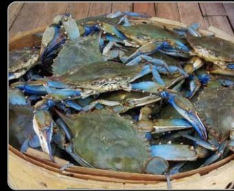
BLUE CRAB When cooked in soup can significantly enhance soup flavor